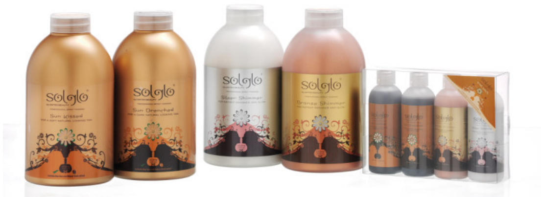
Caption One: Solglo® by United Beauty solutions are available in 1 litre bottles and 100ml sample size. The unusual wide neck bottle means unused solution left in the gun can easily be transferred back to the bottle