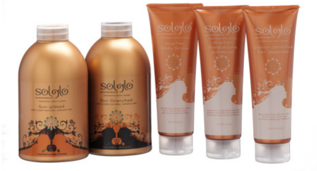
Caption Two: Solglo® by United beauty is available in two strengths; Sun Kissed (8% DHA) and Solglo Sun Drenched (12% DHA)