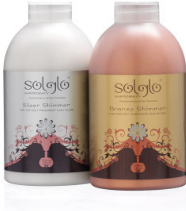
Caption Three: Solglo® Shimmers perfect for Weddings and Parties